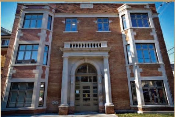
Public Displays of Affection: Moving Day